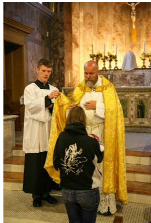
Final blessings at St James' Church