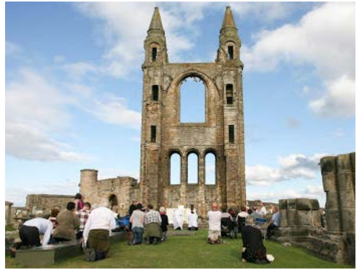
Holy Mass was celebrated below the impressive ruins of the East Window.