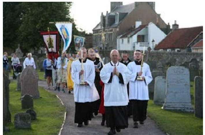
Pilgrims process with St Andrew's relic.