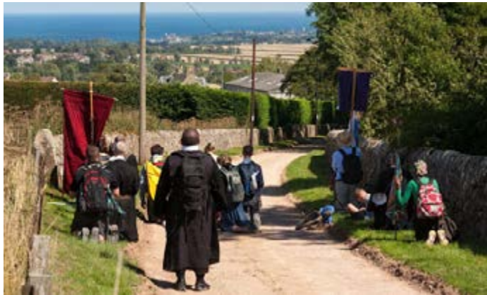
'Monte Gozo' - pilgrims catch their first glimpse of St Andrews

The third and final day was again one with notably clement weather, the whole pilgrimage being walked in conditions which were neither too wet or too sunny to add to the pilgrims' discomfort. Following a morning of walking through the fertile farmland of the Eden valley, the pilgrims ascended the final climb of the pilgrimage to catch their first sight of the cathedral towers in St Andrews about four miles from the town. Following the custom at Chartres, pilgrims fell to their knees and sang the Salve Regina in thanksgiving for their Blessed Mother's protection, together with a hymn in honour of St Andrew.