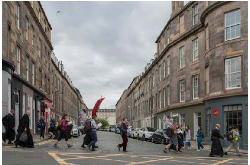
Pilgrims process through Edinburgh's New Town.