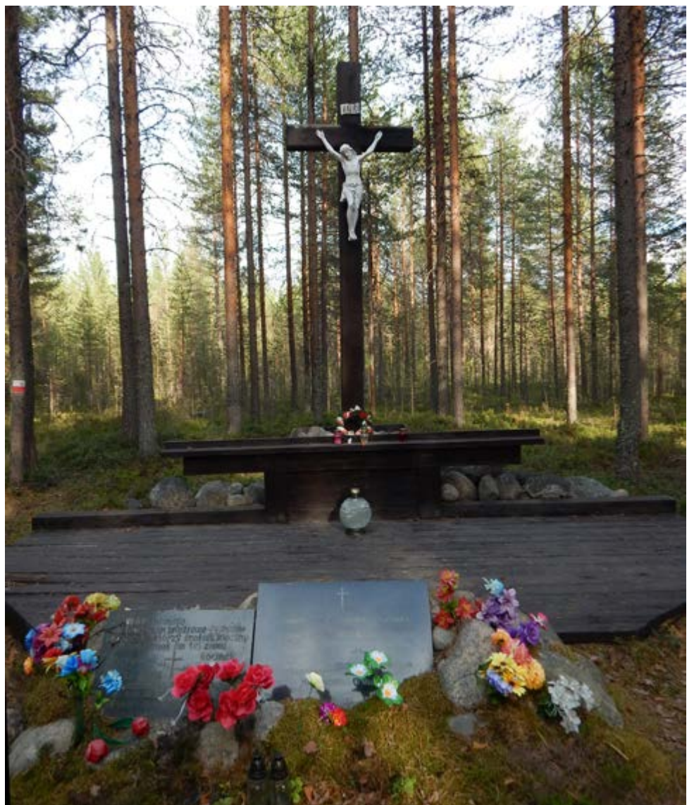
The Roman Catholic cross, one of numerous monuments to individuals and groups executed at Sandarmokh.