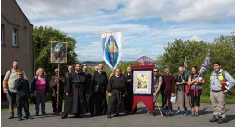
At St Margaret's Church, South Queensferry