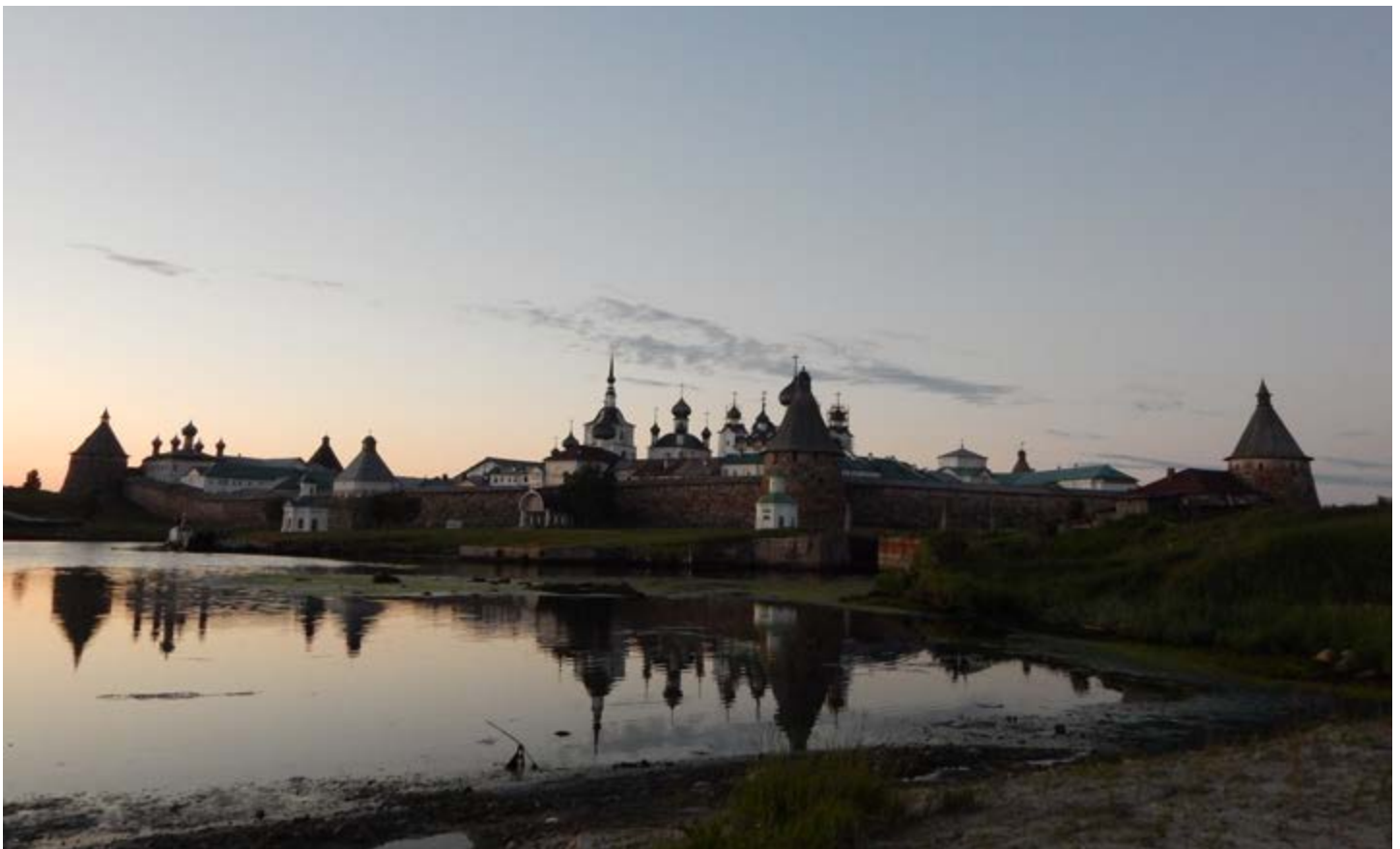
An overall appearance of the Solovetsky Kremlin: the main monastery complex that served as the main premises of the SLON prison camp.

The chief destination for us were the ruins of the St. Herman Chapel, in the forest a few miles from the main monastery complex, which was