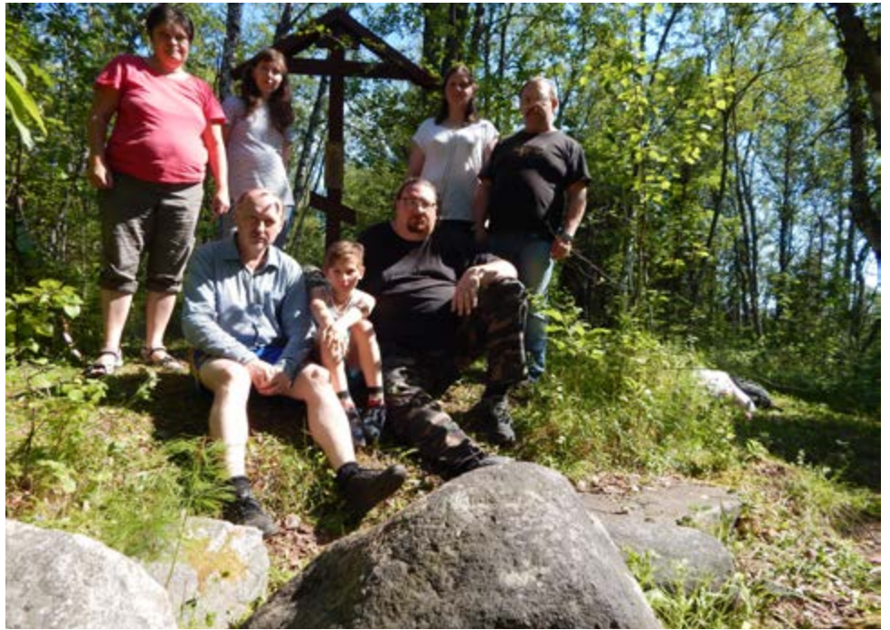
The pilgrims at the cross at the former St. Herman Chapel

The Una Voce-led group could only stay at the Solovetsky Islands for two days. It was decided, however, that we should definitely come here again and spend more time in this place where man-made paradise and man-made hell come so close to each other.