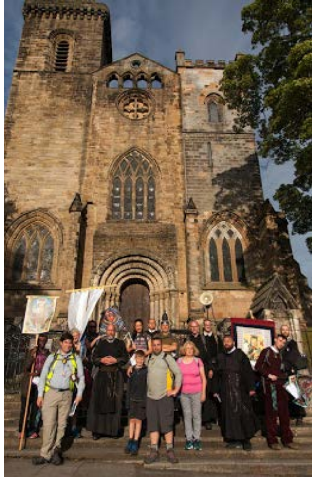
Outside the ancient abbey of Dunfermline