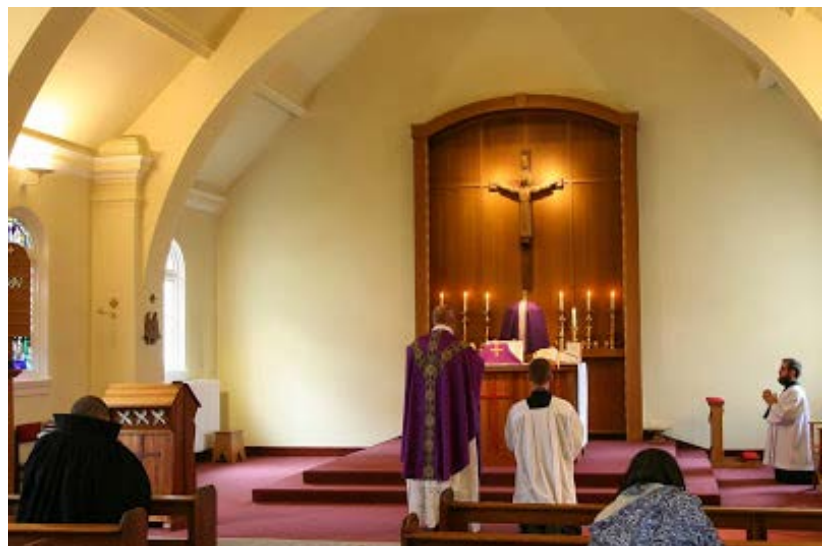
Opening Holy Mass for Pilgrims and Travellers

Leaving Edinburgh by the ancient Cramond Brig, the pilgrims proceeded towards the Firth of Forth where they crossed into Fife at the site of the (now three) iconic bridges which replace a ferry endowed in the eleventh century by St Margaret, Queen of Scots, to assist pilgrims in former times. Arriving in Dunfermline, St Margaret's royal capital, they visited the abbey there and the site of her pre-Reformation shrine, before arriving at the magnificent late nineteenth-century church built in the town to house those of her relics which have survived to the present day.