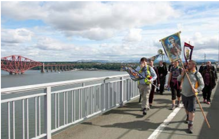
Crossing the Firth of Forth