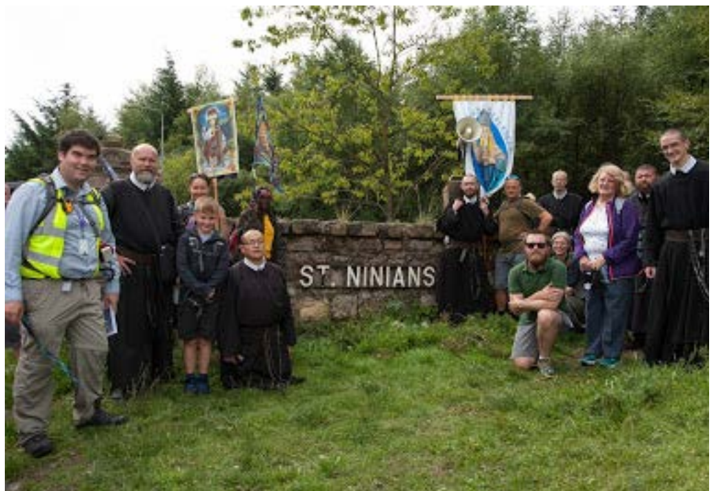
Pilgrims at the entrance to the former St Ninian's mine

Holy Hour at the Chapel Royal, Falkland Palace, which concluded with Pontifical Benediction of the Blessed Sacrament.