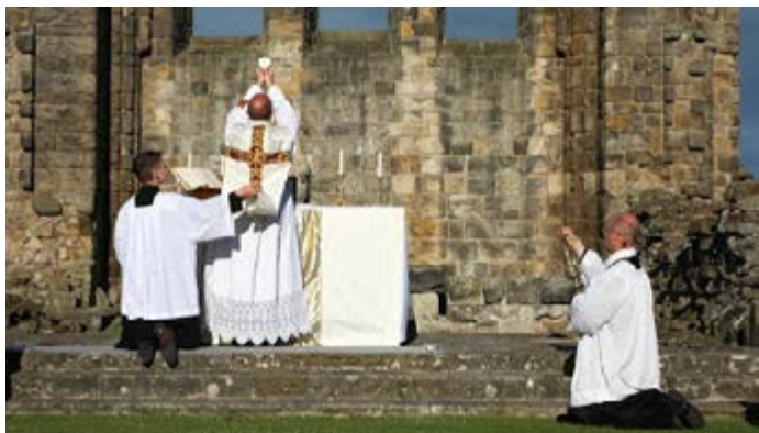
Holy Mass in the cathedral ruins