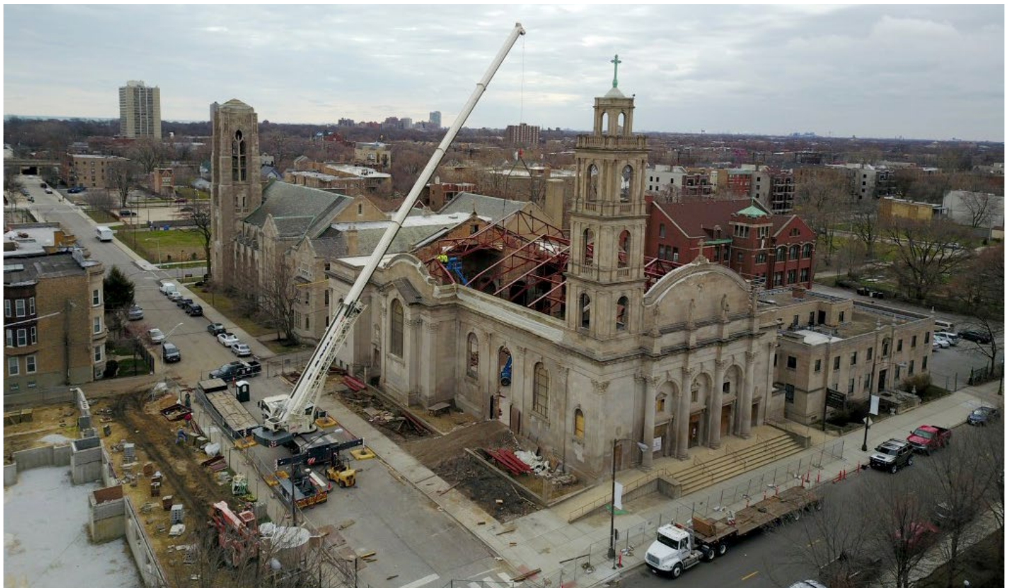
Restoration of Christ the King, Chicago. After a fire devastated the church of Christ the King, home of the Institute of Christ the King in the United States, in October 2015, work has been underway to rebuild the shrine. Here is a video of current progress.