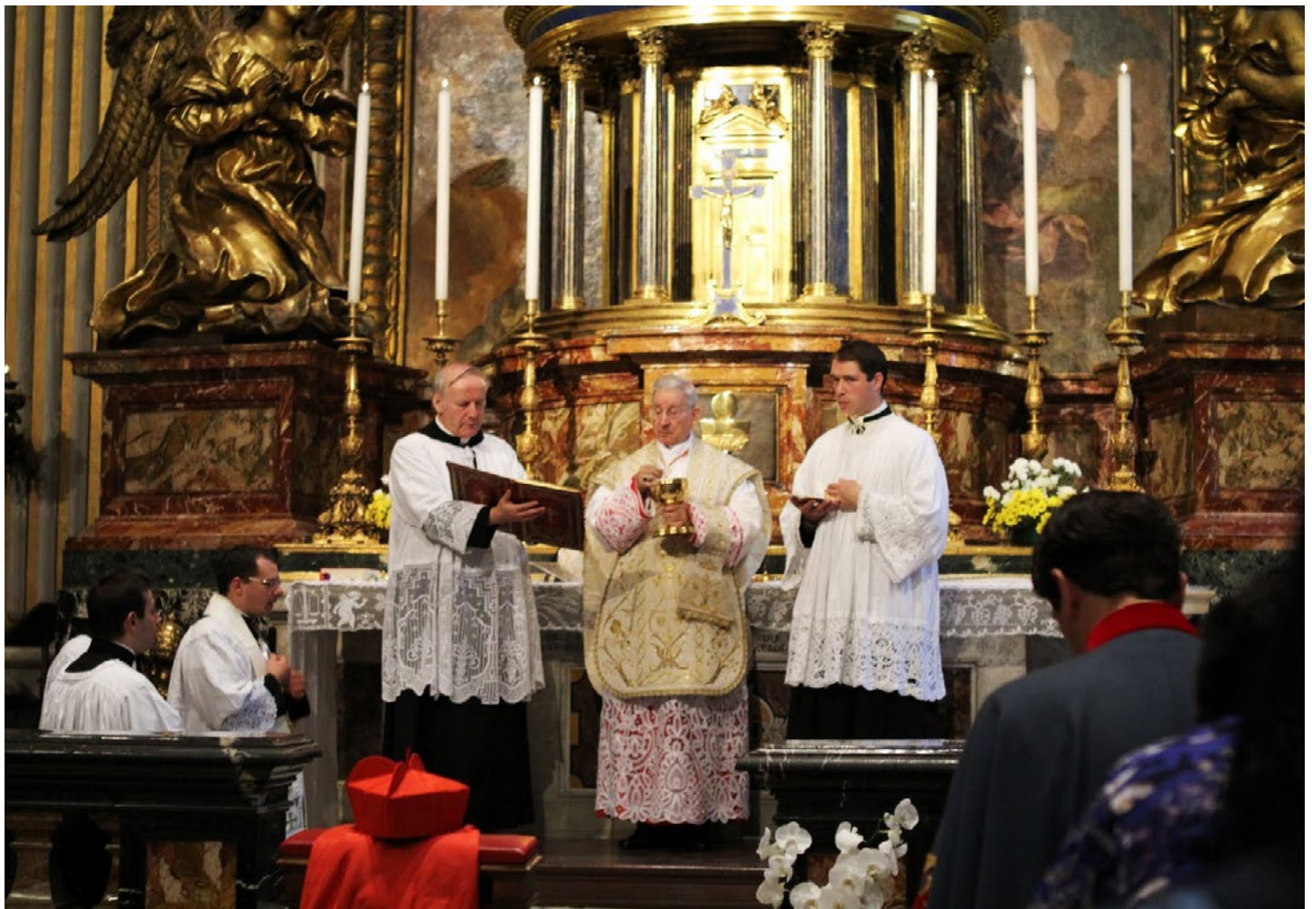
Cardinal Castrillón Hoyos celebrating Mass in the Blessed Sacrament Chapel of St Peter's Basilica on the occasion of the 20 th General Assembly of FIUV in November 2011.

To see more photos of the Mass, roll the mouse cursor along the red arrow track (works in Adobe Acrobat and Adobe Viewer).