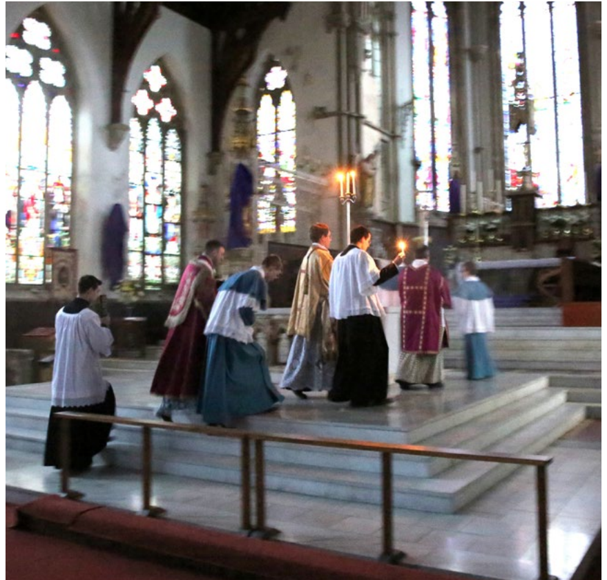
Triple Reed, ICKSP: St Walburge's, Preston, England (Easter Vigil 2018)

Before 1955 the Holy Fire was not used to light the Paschal Candle directly, since the latter was immovably situated in the sanctuary of the church. Instead, it was used to light a 'reed' with three candles, and it was this reed which was carried into the church. The Exsultet then functioned as the blessing of the Paschal candle. The extraordinary changes to this part of the rite were justified in part by claims about ancient practice which have been shown, since the 1950s, to be false.