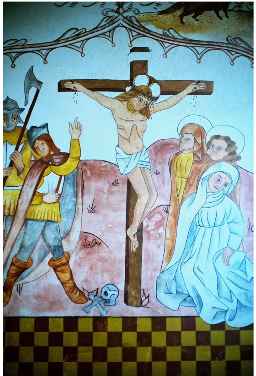
Wall painting at St Teilo's Church. To see more photos roll the mouse cursor along the red arrow track (works in Adobe Acrobat and Adobe Viewer).