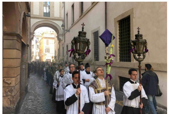
Folded chasuble, FSSP

Thus we find, in what was officially described as the 'Restored Holy Week' of 1955, entirely new elements such as the recitation of the Pater Noster in unison, in the vernacular, on Good Friday, and the 'renewal of baptismal promises' during the Easter Vigil. Many genuinely ancient features, on the other hand, were lost, such as the use of folded chasubles, a very ancient feature of the Roman Rite on penitential days.