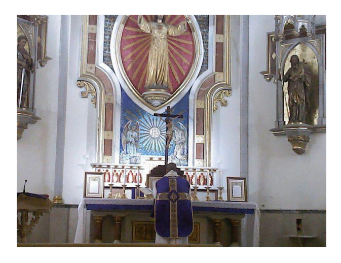
Holy Mass at Parroquia San Jorge

The admission of Puerto Rico in the FIUV in July 2012 was the culmination of contacts and conversations initiated in December 2009. The Traditional Latin Mass was already being celebrated since early 2007, months before Summorum Pontificum was promulgated. The original venue was "Parroquia San Jorge", located in the capital city of San Juan, within the jurisdiction of the Archdiocese of San Juan.