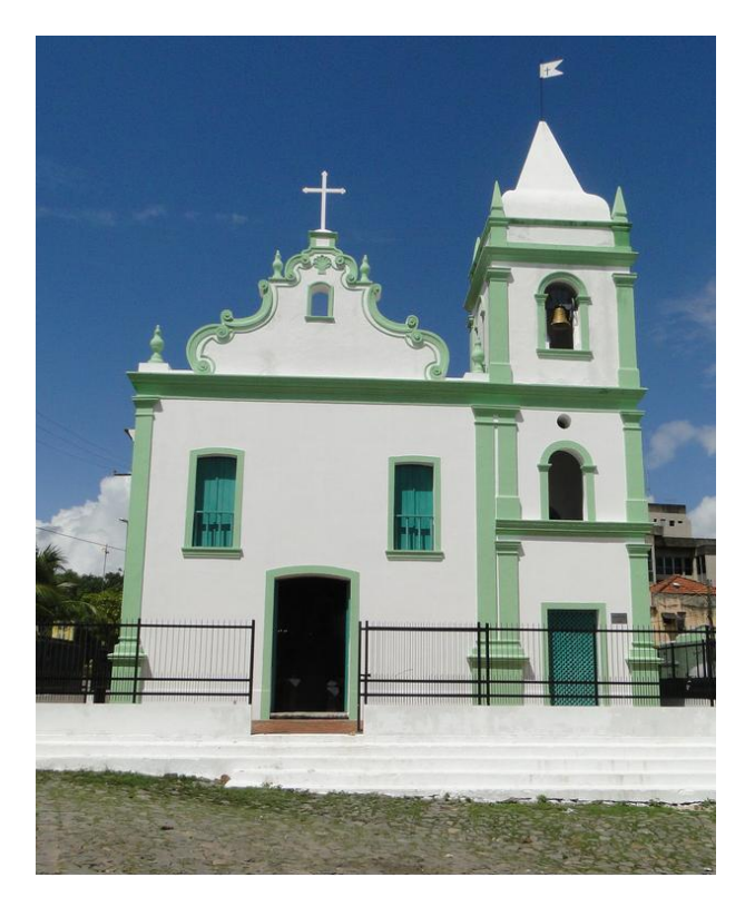
Church of Nossa Senhora do Rosário dos Pretos, Natal, Brazil

The city of Natal, in north eastern Brazil, was founded by Portuguese settlers on December 25, 1599 – hence its name, which means Christmas in Portuguese.