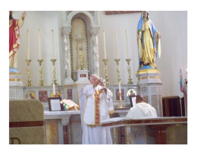
Holy Mass at Parroquia San Jose

Also in December 2009, a second venue was inaugurated at "Parroquia San Jose", in the same Archdiocese. Subsequently, a third venue was established at "Parroquia Protomártires de la Inmaculada Concepción" in the city of Aguada and belonging to the Diocese of Mayaguez. The Traditional Latin Mass is currently offered at the first and third venues, once a month in each parish.